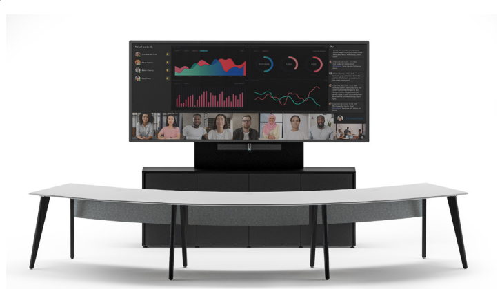
Salamander Designs Credenza in 12" Depth (X1/JCS/347/M1H3/BO/BK) or 21" Depth (X2/JCS/347/M1H3/BO/BK)

All pieces are built to order, manufactured in the USA and backed by a Lifetime Warranty. Customize your own by selecting from our wide variety of styles, materials, sizes and finishes of furniture to support technology, unified communication and maximum user engagement with designer style.