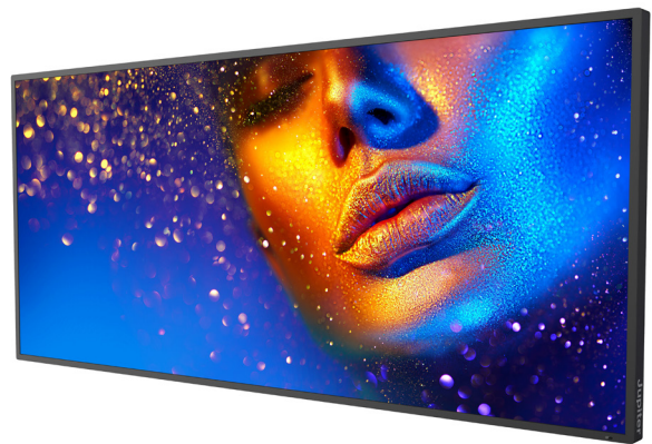
Jupiter Pana's 21:9 ultra-wide 5K (Pana 105")

We believe that 21:9 ultra-wide 5K LCD are the future for enterprise and are committed to leading the way in this space. The Pana is fully engineered and designed from the ground up by Jupiter; this allows us to work with market leaders such as Microsoft to create a fully integrated Signature Teams Room display and solution. Jupiter Pana displays are installed at over 50 Fortune 500 companies in over 22 countries (and growing), many in the Microsoft Signature Front Row MTR configuration.