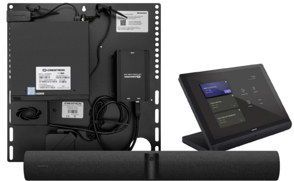
Crestron Flex Small Room Conference System (UC-B31-T)

The UC-B31-T Crestron Flex tabletop conferencing system provides a small room video conference solution for use with Microsoft Teams® Rooms software. It supports single or dual video displays 1 (not included) and features a tabletop touch screen, Jabra® PanaCast 50 video bar, UC bracket assembly, PoE injector, and cables.