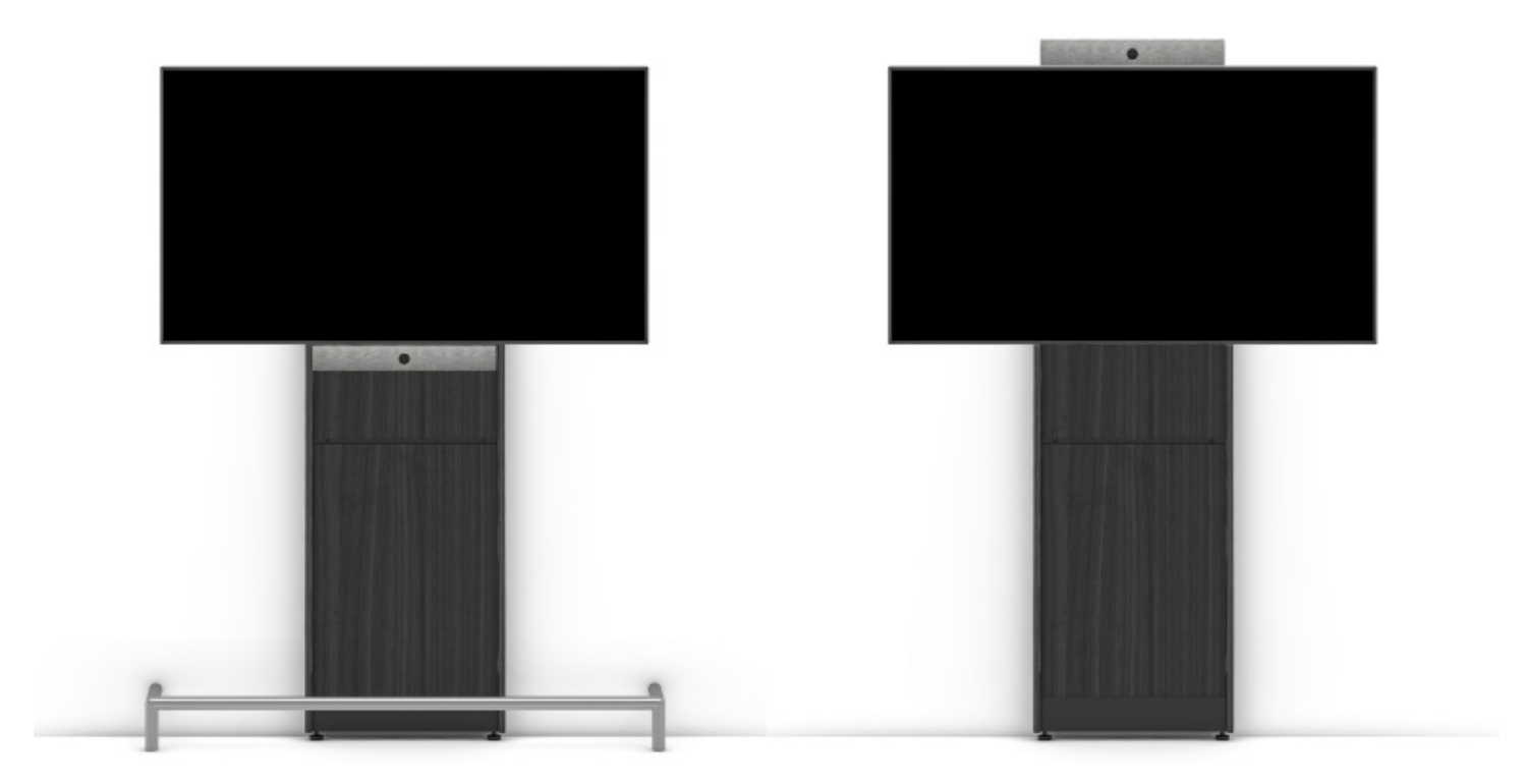
Shown with ADA Rail System accessory (AR1/60/SS)