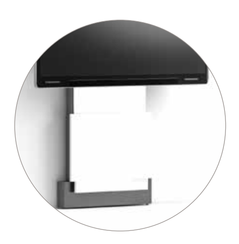
Webex Board Pro 75 Electric Wall Stand White - FPS2WXL/EL/CSP75/GG/VW

Take control of creative, presentation and collaboration work spaces. Salamander's beautiful and highly functional FPS Series Stands offer superior ergonomics complimenting any touch screen display with improved productivity, unrivaled flexibility and lifetime value.