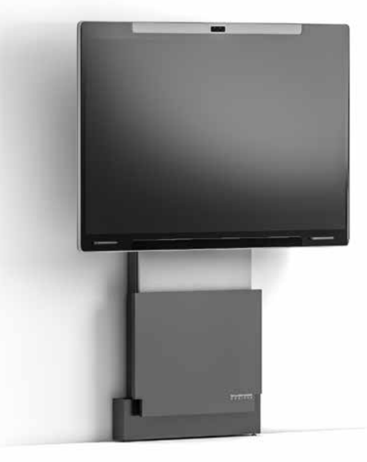
Webex Board Pro 75 Electric Wall Stand Graphite - FPS2WXL/EL/CSP75/GG