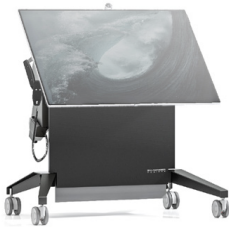
Electric Lift & Tilt Mobile Stand FPS2/ELT/MS/GG