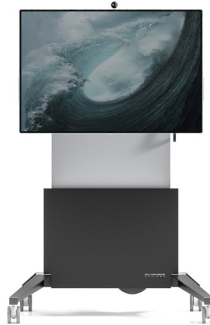
Electric Lift Mobile Stand FPS2/EL/MS/GG