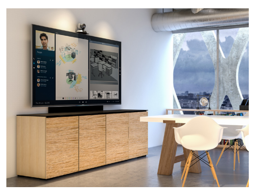
TELEPRESENCE Large capacity Credenzas integrate AV/IT systems.

Solutions for every room and workspace. Our design team matches your high-tech electronics with personalized carts, stands and furniture that allow users to derive maximum benefit of each technology. Roll our mobile carts from room to room—and roll them right into the future with simple upgrades as your technology evolves.