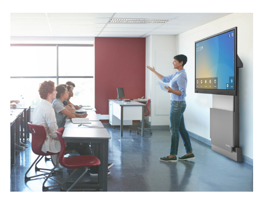
TRAINING Electric Wall Stands raise displays to presentation mode.