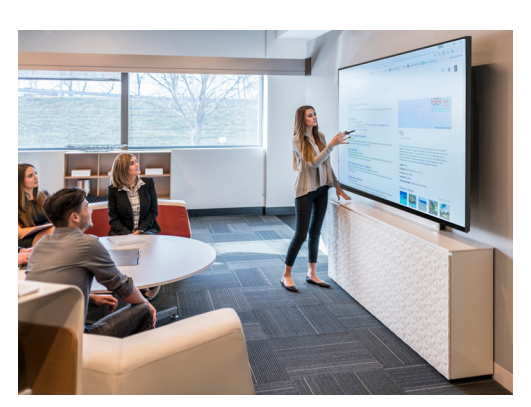
INTERACTIVE Low Profile Cabinets for interactive displays.