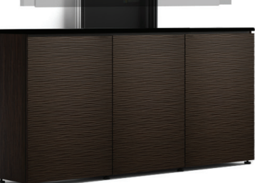
D1/337AM1/BL/WE Low Profile Wall Cabinet

64.75"W x 31.25"H x 12"D (164 x 79 x 305) mm Adjustable Screen Positions