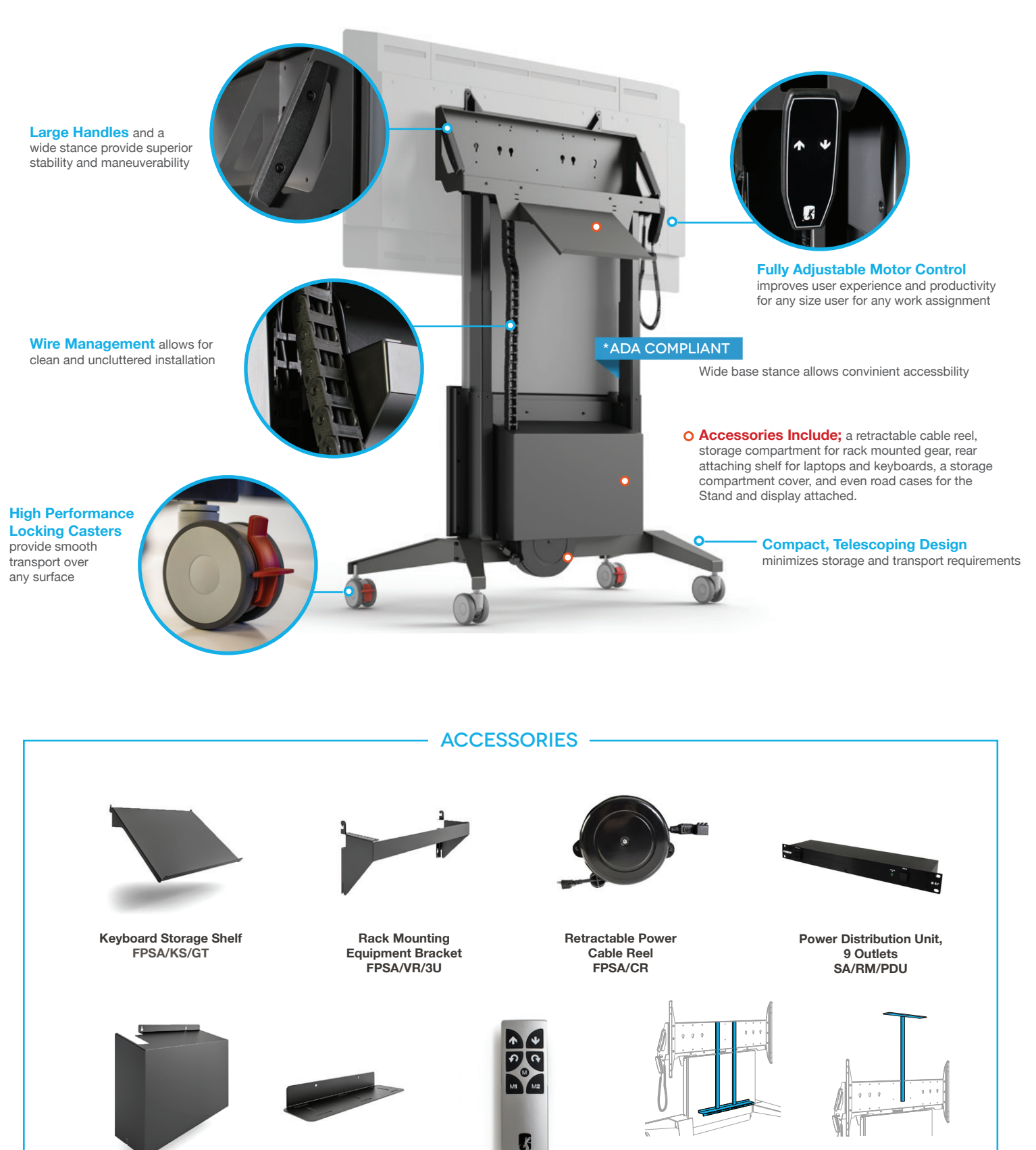
Secure Equipment Storage Cover FPSA/SC/GT