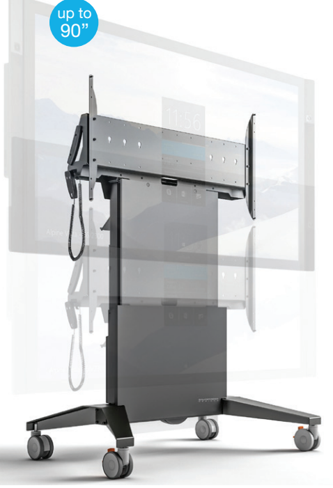
Shown with 84" screen

Salamander Designs creates fully adjustable, electric lift, mobile stands that offer convenience, flexibility, and designer style. The sleek, compact design moves easily between spaces and is designed for touch screen in working, drafting, collaboration, and presentation positions. Accessories include rack-mounted equipment storage, retractable cable reel and more.